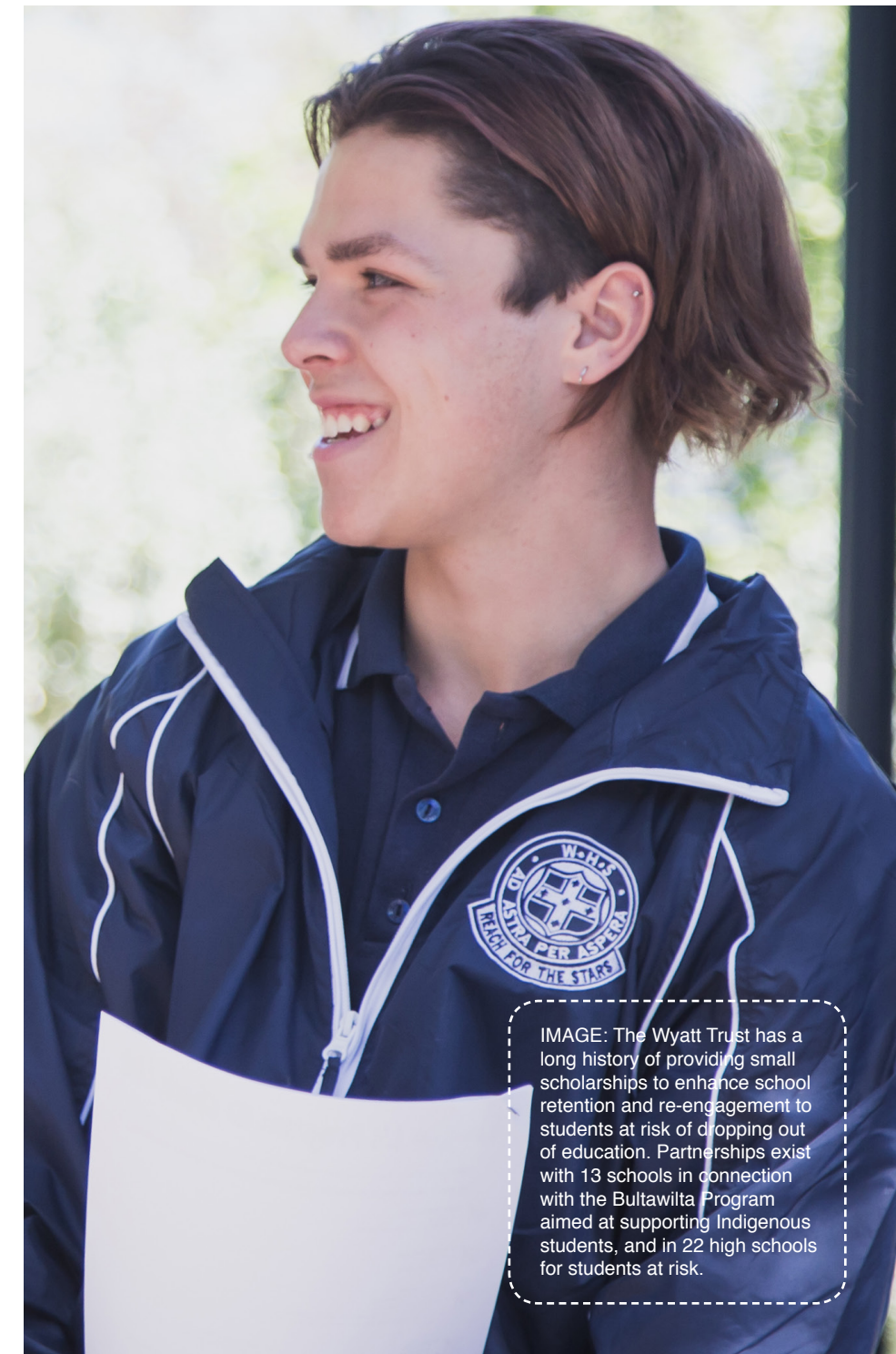
IMAGE: The Wyatt Trust has a long history of providing small scholarships to enhance school retention and re-engagement to students at risk of dropping out of education. Partnerships exist with 13 schools in connection with the Bultawilta Program aimed at supporting Indigenous students, and in 22 high schools for students at risk.