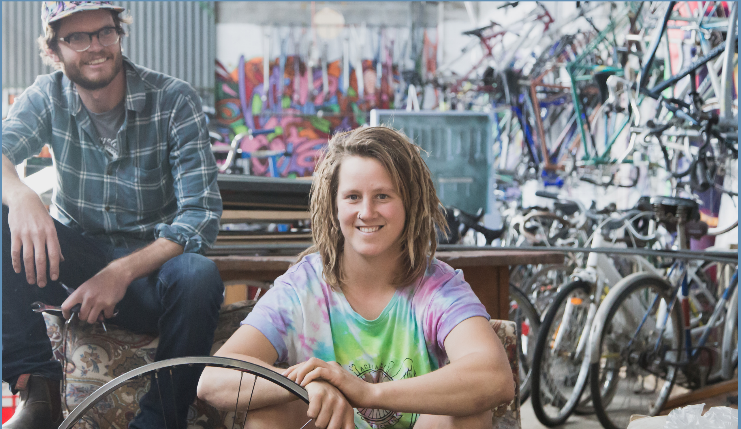
IMAGE: During 2016/2017 Wyatt partnered with the Lions Club of Richmond to fund youth education initiatives in Western Adelaide. The Adelaide Bike Kitchen ran one of the eight inspiring projects funded through this partnership, providing maintenance workshops to Challa Gardens Primary School students who rely on their bikes to travel to and from school.