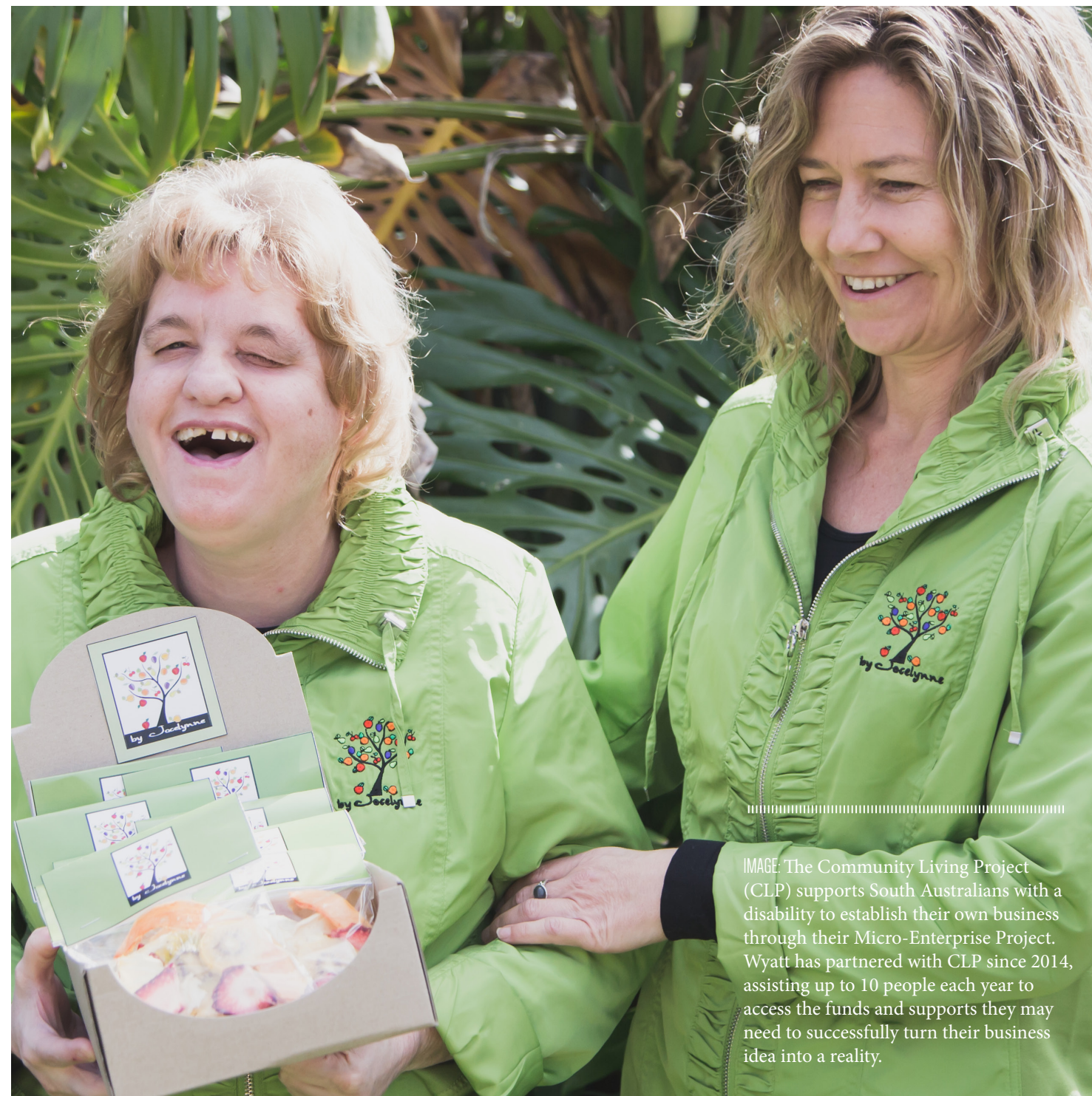
IMAGE: The Community Living Project (CLP) supports South Australians with a disability to establish their own business through their Micro-Enterprise Project. Wyatt has partnered with CLP since 2014, assisting up to 10 people each year to access the funds and supports they may need to successfully turn their business idea into a reality.